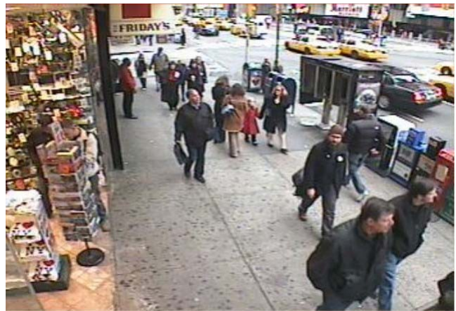
Figure 2. View from a publicly available webcam used to answer the question: is there an unusual number of people absent from (or present in) public spaces? Ten faces were automatically detected in this image.

Historical Database. Images from the Webcam were captured every 10 minutes, 24 hours a day, for 4 work days in the winter (December 6, 7, 8 and 10, 2004). It rained for 2 of the 4 days. The Face Detection Program was applied to each image and the results stored, along with the date and timestamp of the image capture.